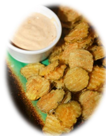
Photo and Recipe credit to: Nicole Hood - creator of 4 The Love of Food Blog

https://www.4theloveoffoodblog.com/southern-fried-pickles/